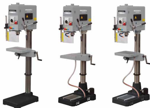
MG: Rotating table plate